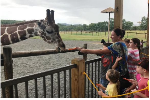
Enjoying animals and a picnic lunch at Tobias Wildlife Park on a rainy August day